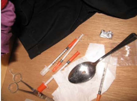
Heroin and paraphernalia located at the scene of a suspected death by heroin overdose.